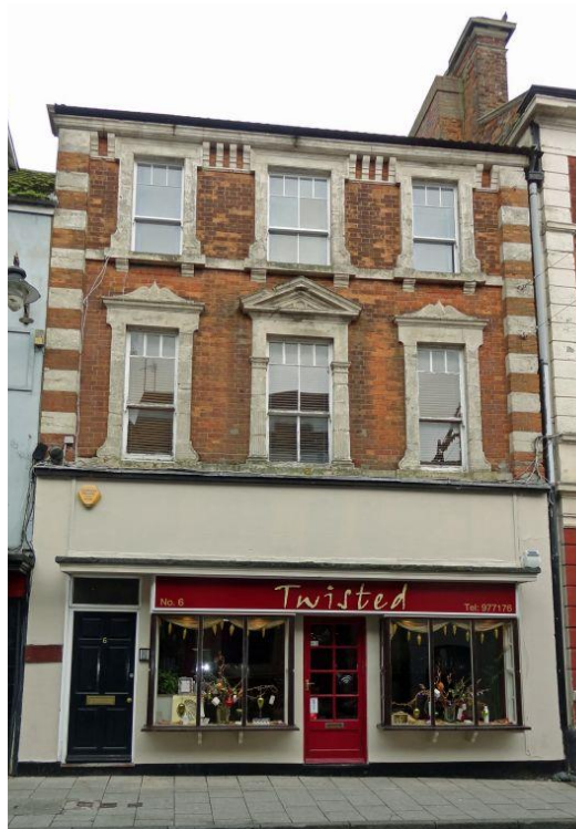
No 6 Wood Street, Swindon, Wiltshire (Photo taken 2021)