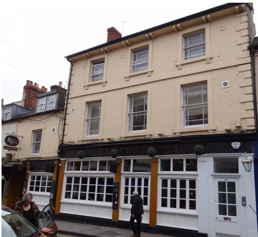
No 27 Wood Street, Swindon, Wiltshire (Photo taken 2021)

Henry died 5th October 1879 in Faringdon, Berkshire.